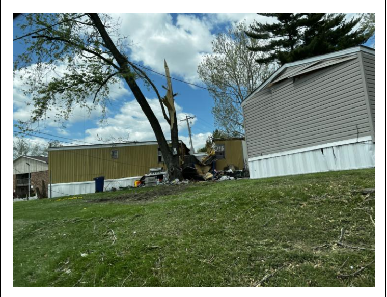
A tree cut this trailer in half