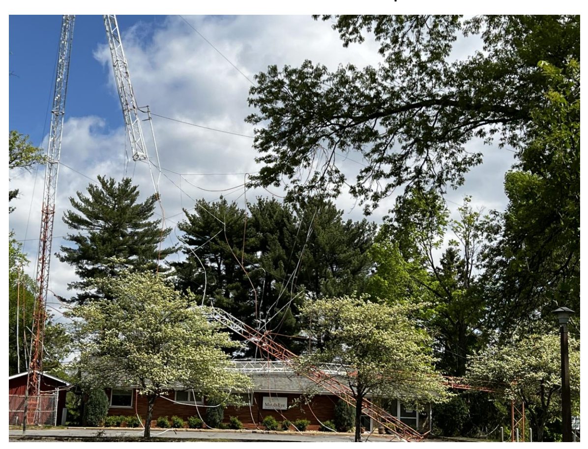
Ex WMYR-FM Antenna Tower lays on Studio Building