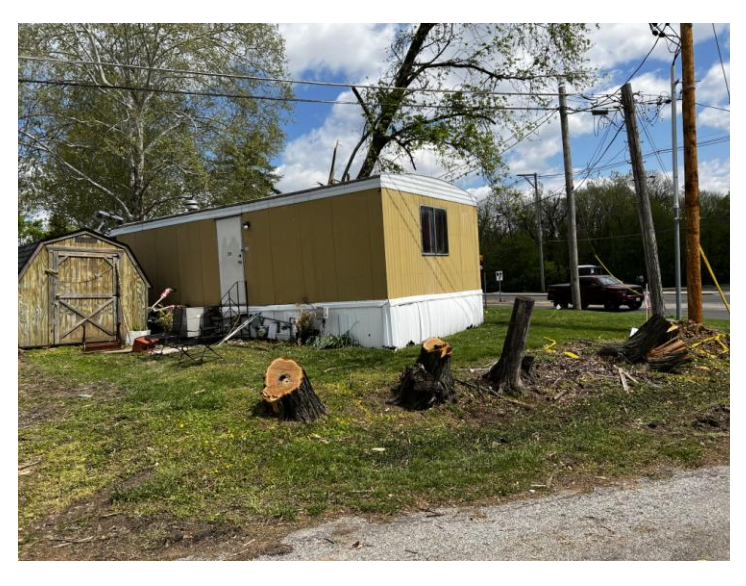
Pawnee Drive at North Illinois St.