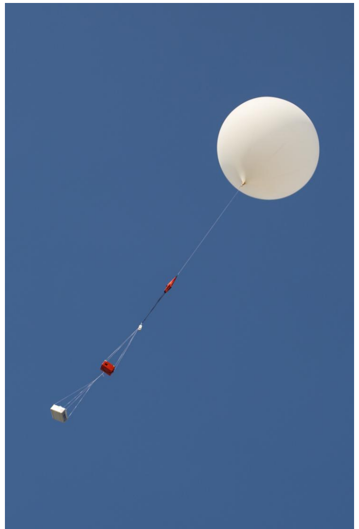
Balloon, recovery parachute, and payloads just after launch