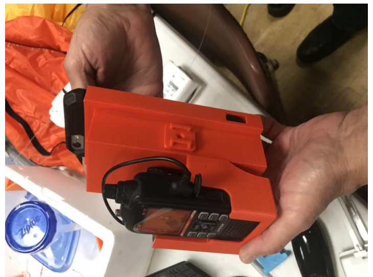
HT and Smartphone used to track radiosondes