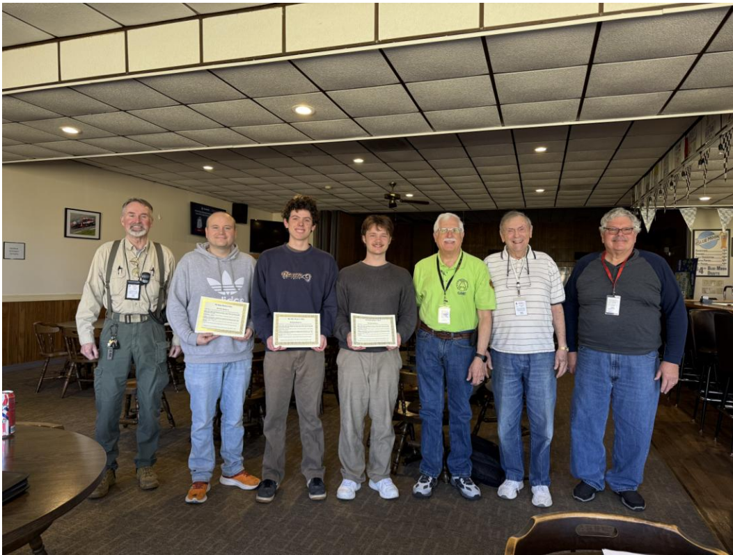
VEs and New Hams