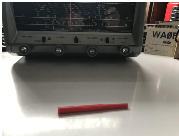
Several submitted answers, one being close, but it's a Heathkit Nut Launcher!