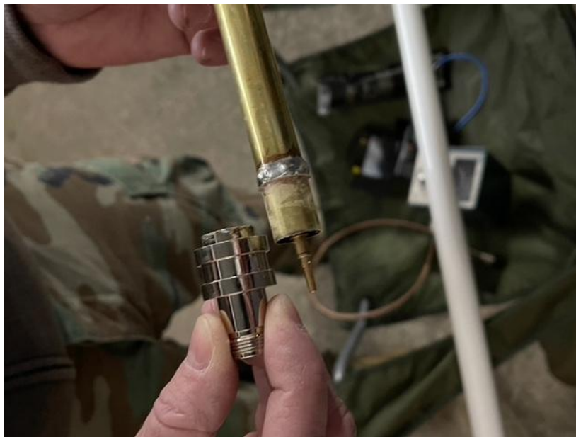
N connector should be soldered on to the brass tube.