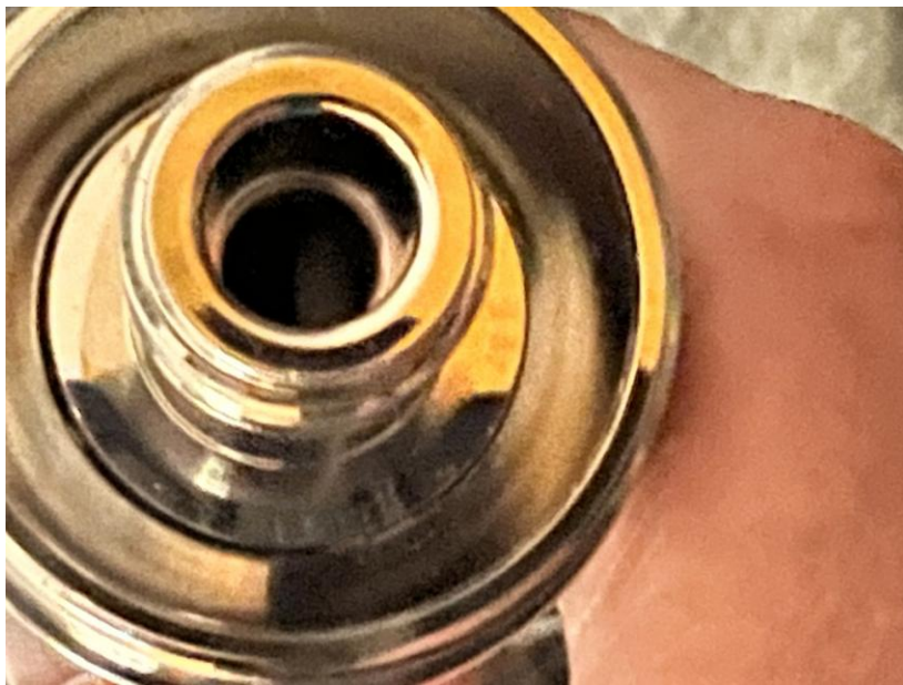
N connector at the bottom of the antenna; notice there's no center pin.