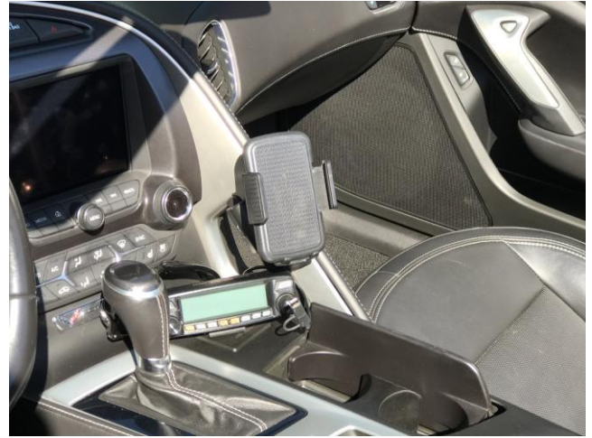
Dean's K9JDW sharp looking mobile installation.