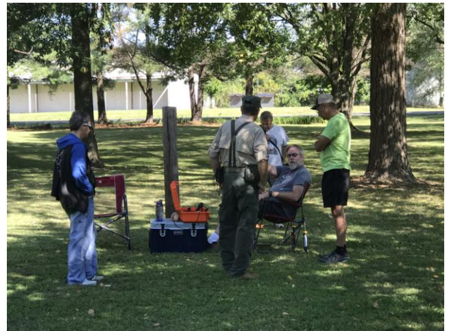
Group discussing POTA